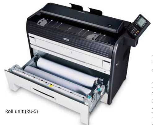
Roll unit (RU-5)

TK-950 Toner-kit: Toner for 2,400 m with A0 width 5% coverage Toner for 2,000 m with A0 width 6% coverage